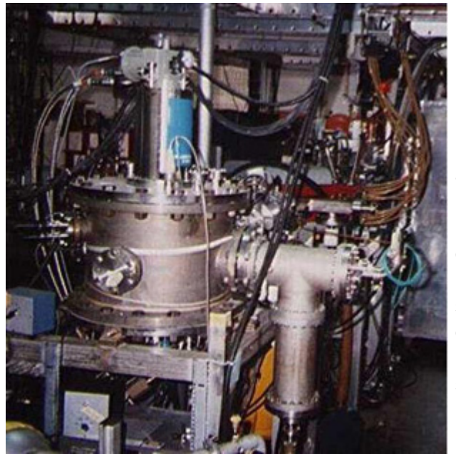
Photo 4 on the left shows one of the separator pumps at the Dulce genetics facility. Taken from Level 5, this is for working with blood plasma:

Photo 5 below shows Barry King and me together at my flat in St Ives, Scotland: