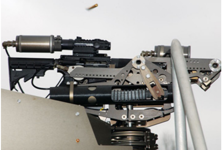
Photo 3 on the right shows the ROWS (Remote Operational Weapons System) hardware at Oak Ridge. This is a heat-seeking mechanized rifle system that automatically locks onto anything in its sensor range. It fires upon the command of guard underground:

photo below of Oak Ridge facility: